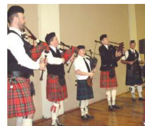
ADK Pipes & Drums

The Pipes and Drums showcased their drum corps and their competition ensemble, as well as performing several sets with the entire group. They are now preparing for Memorial Day parades and the Highland Games season..